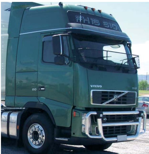
A current example of a bullbar that does not interfere with the integrated energy absorbing FUPD

It is important that bullbars do not interfere or compromise energy absorbing Front Underrun Protective Devices. A bullbar has been developed that is designed to protect the vehicle from animal strike damage without compromising the energy absorption characteristics of more advanced Front Underrun Protective Devices.