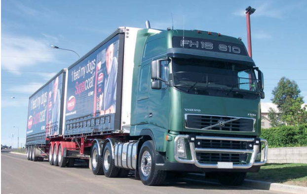
An example of a complying B-double

In addition to the current 25 metre long B-double operating conditions, operators who choose to operate a 26 metre long B-double can do so, provided they meet a new set of operating conditions.