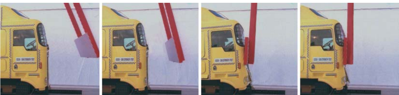
Front impact test on a Kenworth

The approval plate shall be attached in a position where it may be easily inspected by an enforcement officer.