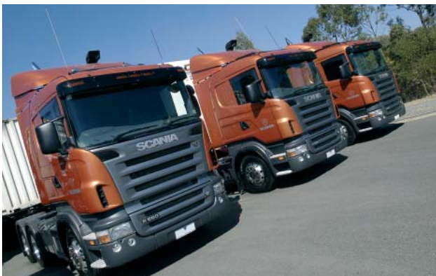
An example of crash-worthy cabins

Vehicles manufactured after 2005 must also have stronger crash-worthy cabins, which will better protect B-double drivers in the event of a crash.