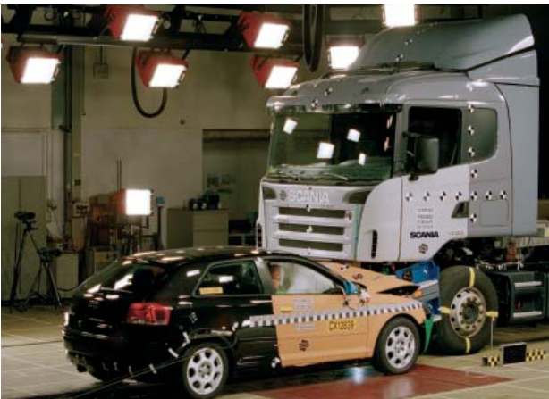
Front underrun protective devices assist in activating safety features in cars

See UN ECE Regulations for full details at the website: www.unece.org/trans/